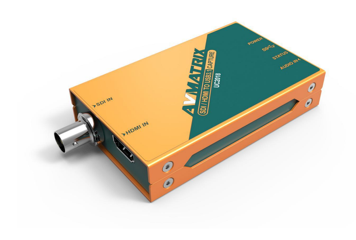
SDI & HDMI to USB3.1 Gen 1 Video Capture User Manual V1.0